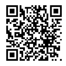
by Phil Lehenbauer

You can support your church family by giving in person or online. Enjoy the musical selection as a time to give thanks to God for all with which you have been blessed. Thank you! Use the QR code to the right or give online here: <u>https://www.firstumcsaginaw.org/give/</u>